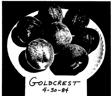
Figure 2. Fruit of 'Goldcrest' peach harvested in Arvin, Calif.