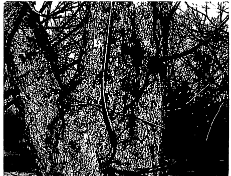
Figure 1. Characteristically scaly bark of a mature 'Schley' trunk. Sprouts often develop from latent buds; sprouting from the trunk is characteristic of 'Schley.'

Budbreak of 'Schley' begins about four days before that of 'Stuart' (21). Consequently, 'Schley' is more susceptible to late spring freezes than 'Stuart' (27). The foliage is glossy, but tends to be yellowish as in 'Cape Fear' (4). Under conditions of prolonged periods of high light intensity, the leaves of