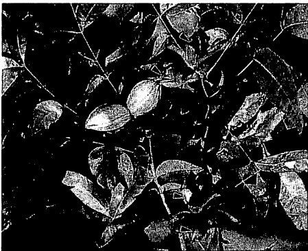
Figure 5. Premature shuck opening in 'Schley' (points). This disorder is sometimes referred to as "tulip disease." The disorder can occur in many other cultivars and especially in years of high fruit set. Photographed October 12, 1988, Perry, Georgia.

'Schley' precocity is similar to 'Stuart'; but yielding capacity as a mature tree is about 20% less than 'Stuart' (21). The