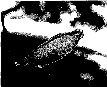
Figure 4. 'Schley' fruit photographed August 7, Philema, Ga. Sutures are prominent; both base and apex are characteristically blunt.

was much greater in 'Schley' than in 'Stuart' (22). Similarly, tree loss was greater in 'Schley' when hurricane Hugo hit a 'Stuart'-'Schley' orchard in South Carolina.