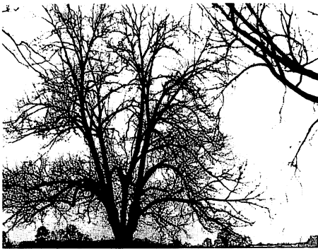
Figure 2. Tree form of a mature 'Schley'. Note the arched growth pattern of the lower scaffold limbs. Profuse branching contributes to the closed canopy.

'Schley' may become somewhat bleached in appearance. Sometimes this symptom is mistakenly diagnosed as potassium deficiency. Leaf retention in the fall is average (15). Tree vigor is less than 'Stuart' (1). The mature bark of 'Schley' is very scaly (Fig. 1).